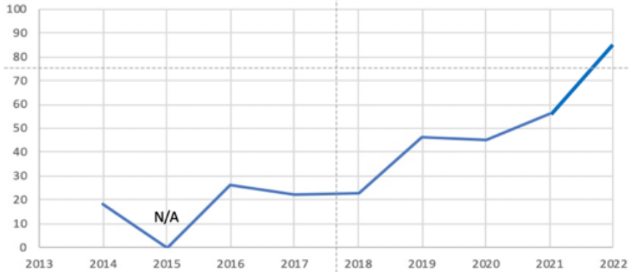
Percent of graduates attending 'more selective' or better colleges (US News)

As a classical academy, Latin H and Greek H are weighted 1.0 additional point. All other honors classes are weighted 0.5 additional point.